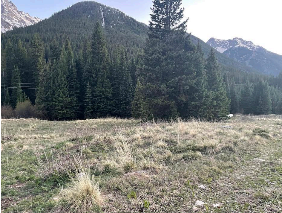
Chapman Gulch looking southwest from road where the Burn Piles area is proposed