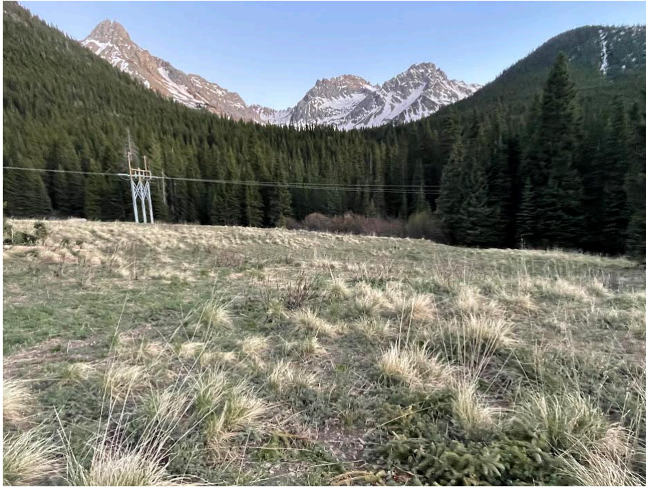
Chapman Gulch looking south of the road where the Burn Piles area is proposed